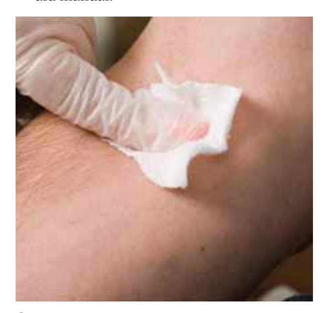
Wound Care Apply pressure to a wound to stop any bleeding. What other steps should be taken to treat a minor wound?