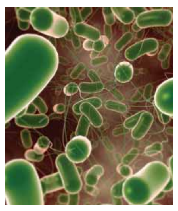
Bacterial Illness Salmonella bacteria is one of the leading causes of foodborne illness. How could you help prevent the spread of salmonella in a foodservice operation?

Parasites can be eliminated from food by following proper cooking methods. Freezing the food product for a number of days also