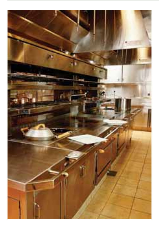
Fire Protection This professional kitchen has several pieces of fire protection equipment. How might the sprinkler system be used?

NSES B Develop an understanding of chemical reactions.