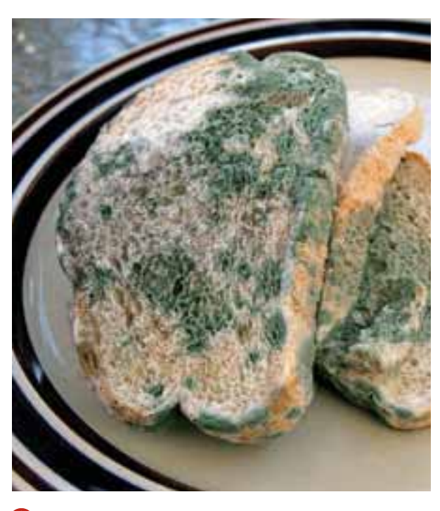
Forms of Fungus Mold is a type of fungus. Why are some types of fungi safe to eat, but others are not?

NCSS II B Time, Continuity, and Change Explain, analyze, and show connections among patterns of historical change and continuity.