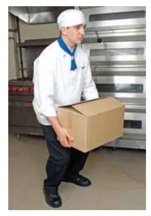
Avoid Back Injuries If you decide to lift an object by yourself, it is important to use the correct lifting technique. How is this employee using a correct lifting technique?

Reading Check Identify What type of shoes should you wear to work in a kitchen?