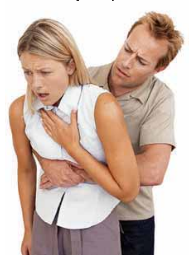
Heimlich Maneuver The Heimlich maneuver can be performed on a choking, conscious adult. When would you not perform the Heimlich maneuver?